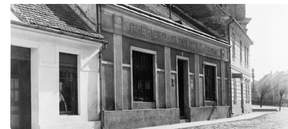
Branch of the American-Slovak Bank in Skalica