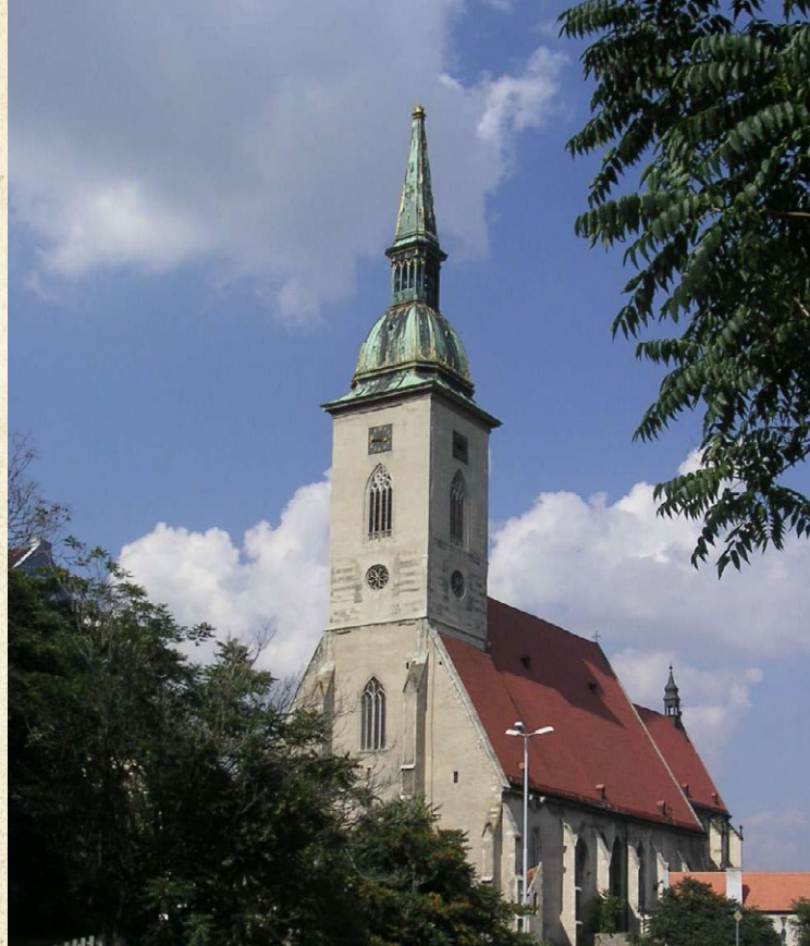
▲ St Martin's Cathedral in Bratislava.

The aristocratic and ecclesiastical elites from all the Habsburg dominions converged on this Danubian capital. There were spectacular celebrations, processions and feasts that generated great enthusiasm among the local populace.