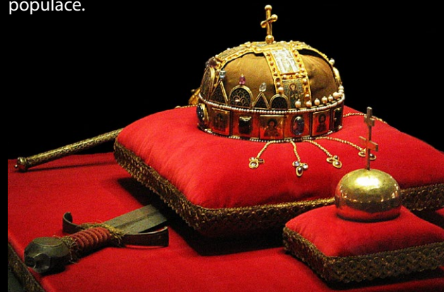
▲ The Hungarian Crown Jewels from 1857.

The aristocratic and ecclesiastical elites from all the Habsburg dominions converged on this Danubian capital. There were spectacular celebrations, processions and feasts that generated great enthusiasm among the local populace.