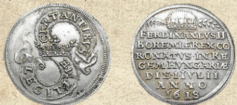
▲ Silver medal commemorating the coronation of Ferdinand II as Hungarian king.

Later, however, it took on a more political dimension. In the early stages, Ferdinand overcame Frederick V of the Palatinate in a struggle for the thrones of Bohemia and the Holy Roman Empire, thus assuming sovereignty over Protestants in northern Germany. The war's first phase ended with the signing of the Peace of Prague in 1635. Ferdinand died two years later, leaving his son, Ferdinand III, to continue his battles.