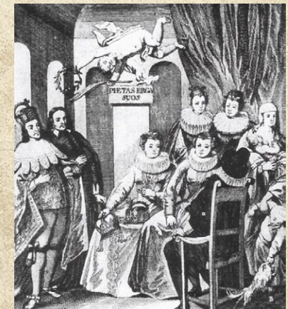
▲ Engraving of Ferdinand II with past and present relatives.

Ferdinand II was one of the most significant figures in 17th century European history. Besides holding the Hungarian crown, he was also King of Bohemia and Holy Roman Emperor. A devout Roman Catholic, Ferdinand played a major role in the re-Catholicisation of central Europe.