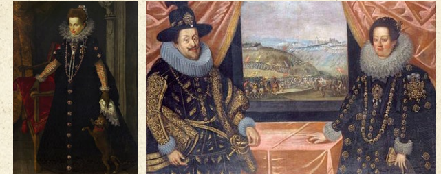
▲ Ferdinand's wives: the first, Maria Anna of Bavaria, with whom he had seven children (left); and the second, Eleonora Gonzaga, princess of Mantua (right).

The centrepiece of the coronation ceremony itself was the Coronation Mass at present-day St Martin's Cathedral, after which the new king, wearing his crown and coronation attire, proceeded through the streets and performed further traditional ceremonial acts: knighting selected noblemen at the Franciscan Church of the Annunciation, taking the coronation oath, and presenting himself on top of the Coronation Mound next to the Danube River.