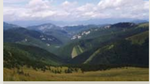
View at Gaderská dolina

The most favorite tourist locations include Gaderská and Blatnická valleys, the highest crags of Turiec basin – Tlstá and Ostrá, the central ridge in Krížna, Ostredok and Borišov localities, Blatnica and Sklabiňa castles, and the folk architecture reservation – Vlkolínec village, a one-of-a-kind location included in the UNESCO world heritage list.