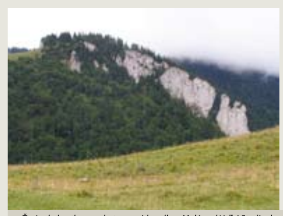
Ťavia skala - the crag between side valleys Malé and Veľké Studienky