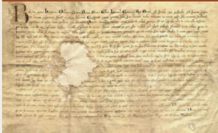
The original charter of the town of Banská Bystrica issued by its founder, Béla IV

In 1380 the town joined the Union of mining towns of central Slovakia and silver and copper mining remained the main source of the town's wealth until the mid-16th century. Mining was operated by the citizens