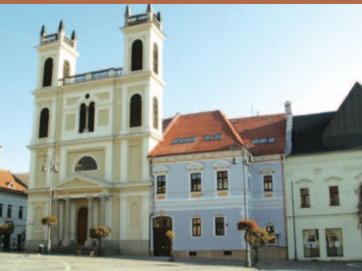
St Francis Xavier's Church

During the Slovak National Uprising (1944), Banská Bystrica became the political, military and administrative centre for the anti-fascist resistance in Slovakia. On a site close to the town fortifications, a Memorial of the Slovak National Uprising was opened in 1969, and still stands as one of the finest examples of 1960s architecture. Today, the town is an important cultural and administrative centre.