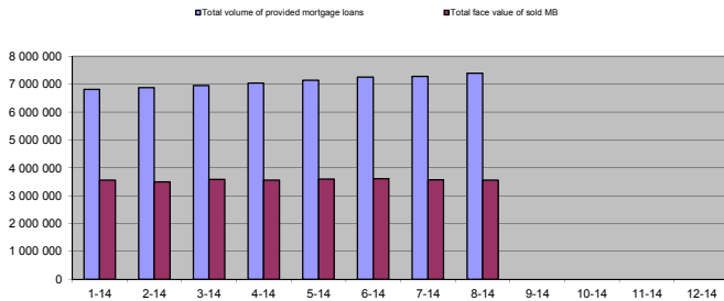
Drawn mortgage loans in comparison with sold MB in 2014