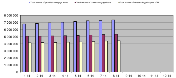
Development of mortgage loan in 2014