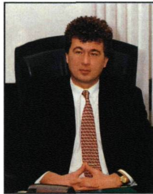
Vladimír Masár Governor