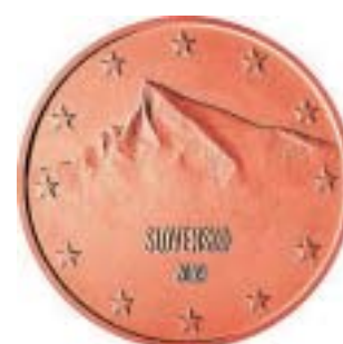
1 cent, 2 cents and 5 cents