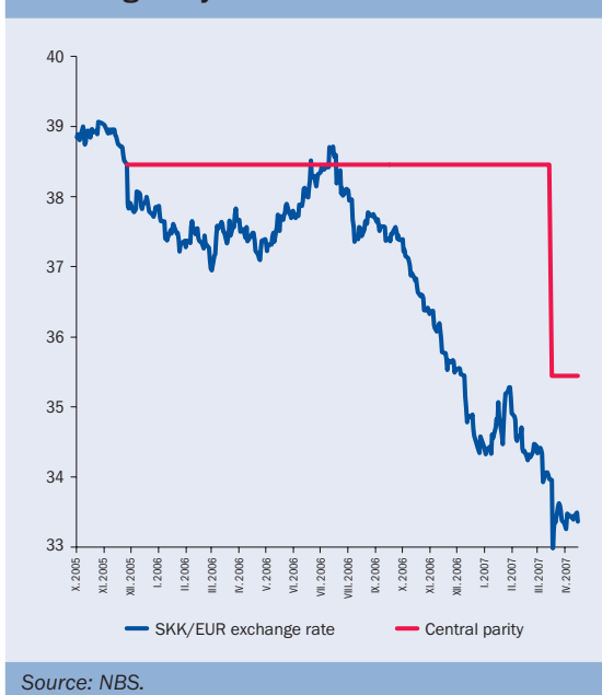
Chart 88 The koruna's exchange rate following entry into ERM II

of relatively low inflation, these developments were reflected in the level of the nominal exchange rate. As a consequence, the central parity ceased to be in line with the current state of the economy. At the request of Slovakia, and with the agreement of members of the ERM II Committee, the koruna's central parity in ERM II was revalued with effect from 19 March 2007, to SKK 35.4424 per euro. The lower compulsory intervention rate was reduced to SKK/EUR 30.1260 and the upper compulsory intervention rate to SKK/EUR 40.7588.