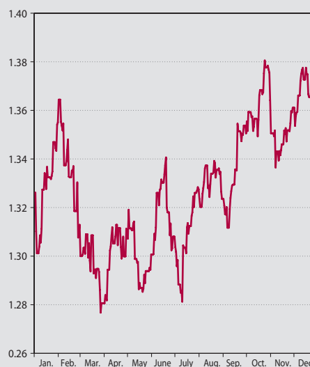
Chart 9 USD/EUR exchange rate in 2013

The exchange rate of the euro against the US dollar was volatile during 2013. It reflected market expectations for euro area monetary policy, volatility in foreign exchange markets, and anticipation of the US Federal Reserve System's