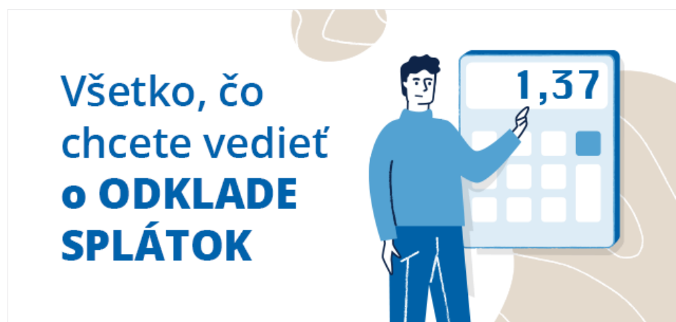
All you need to know about loan moratoria

By the end of 2020, within a period of one month, the project had attracted more than 1,600 followers on Facebook and more than 1,100 followers on Instagram, while its website had received around 35 thousand visitors. Subscribers to the 5peňazí mailing list receive an electronic newsletter once a month.