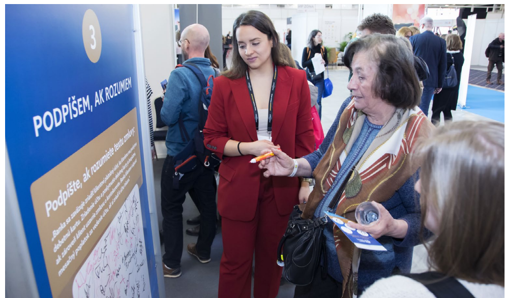
The Bank also promoted financial education through its stand at the job fair entitled "Profesia days Bratislava 2020"

Early in the year field workers of Slovak labour and social services offices took part in meetings as part of a project entitled "Train the Trainer", in which the Bank provided them with a grounding in financial education. The aim was to have these field workers use what they learnt at these meetings in their day-to-day interactions with poorer members of society. The project was suspended for the rest of the year owing to the pandemic crisis.