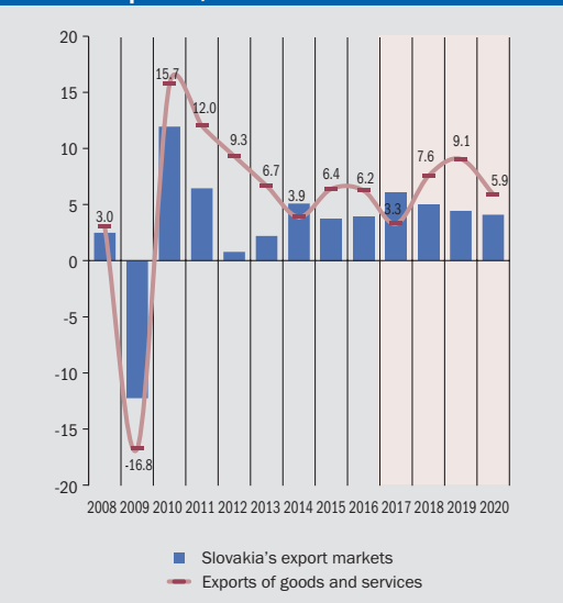
Chart 2 Slovakia's foreign demand and exports of goods and services – trend and forecast (annual percentage changes; constant prices)