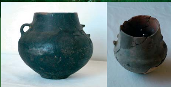
Archaeological findings from Beša

The 100 th Anniversary of the Death of ANDREJ KMEŤ SILVER COMMEMORATIVE COIN