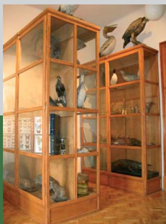
Exhibits of the A. Kmeť Museum