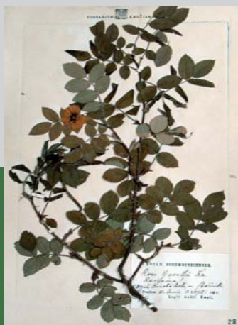
A herbarium specimen