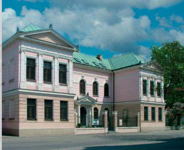
Andrej Kmeť Museum in Martin

Andrej Kmeť is acknowledged as the founder of the Slovak National Museum, as well as the originator and initiator of the Slovak Museum Association (1893), the main programme of which was the preservation of artefacts of the Slovak history. As the first and life Chairman of the Association, he pursued its collecting programme. His own collection of archaeological findings, artefacts of folk culture and history, and objects of animate and inanimate nature became the basis of the collections of the first national museum of the Slovaks. It was thanks