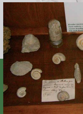
Exhibits from the geological collections