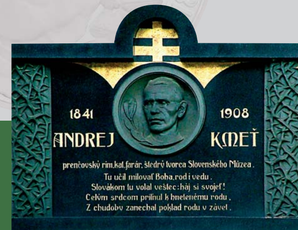
Memorial at the presbytery in Prenčov